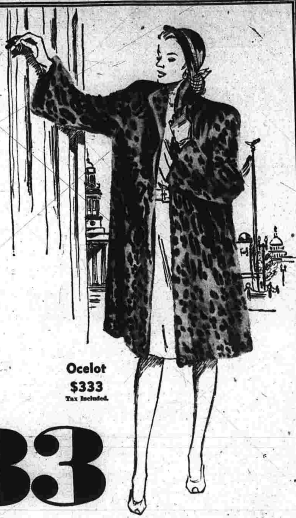
Ocelot $333 Tax Included

Hollander Mink or Sable Blend Northern Back Muskrat $333 Tax Included