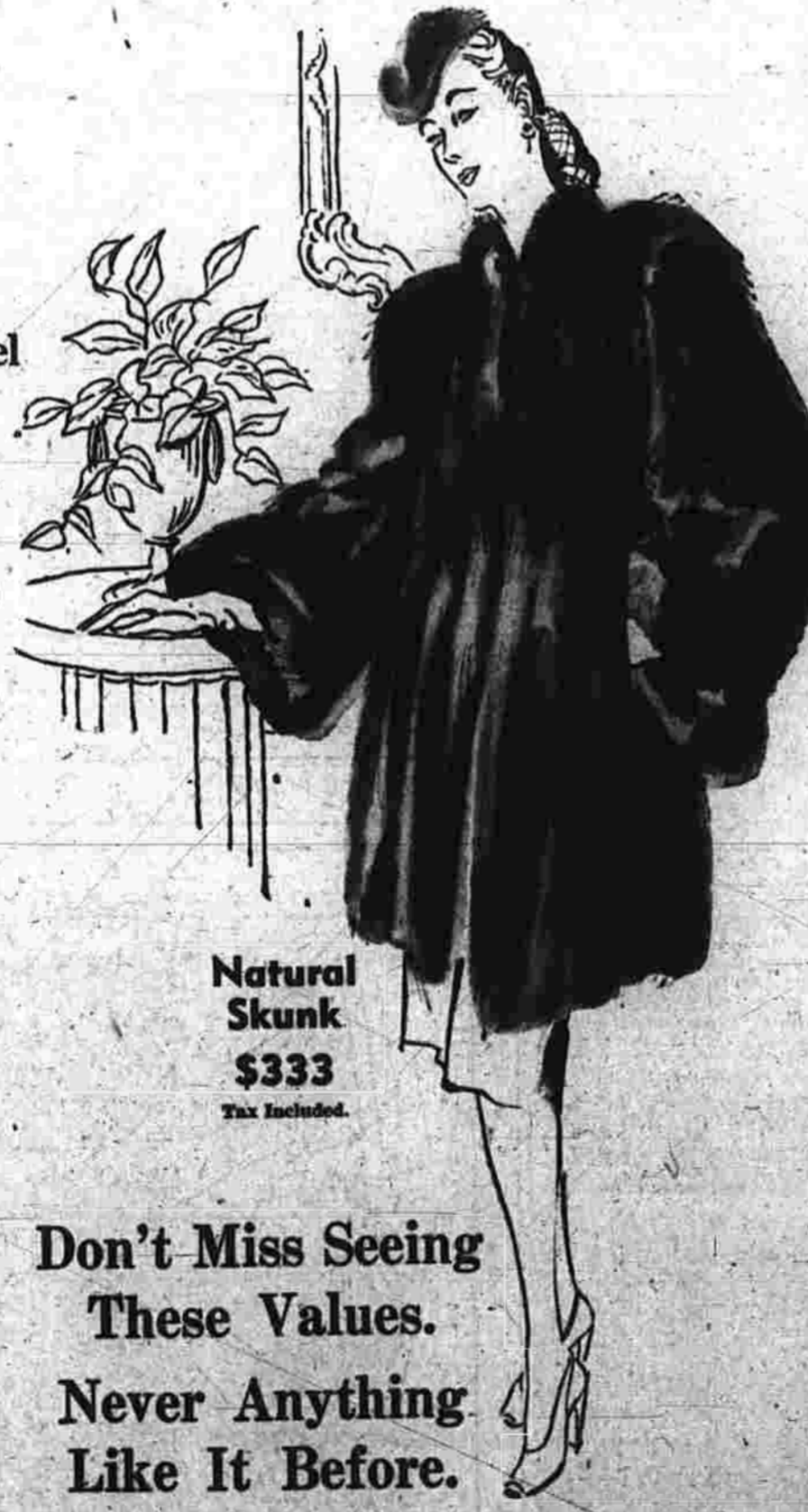
Natural Skunk $333 Tax Included